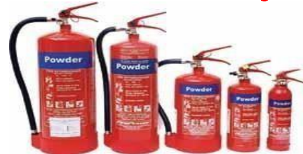
Dry Chemical Powder Type