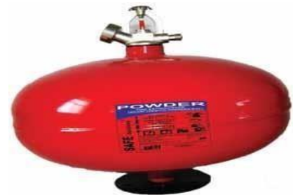
Automatic Fire Extinguisher