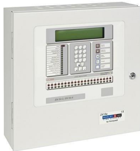
Fire Alarm Panel