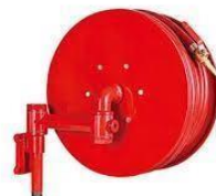
Hose Cabinet & Hose Reel Drum (swinging type)