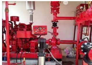
Hydrant Fire pump