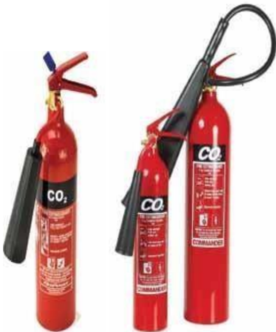
CO2 Fire Extinguisher

A fire extinguisher is an active fire protection device used to extinguish or control small fires, often in emergency situations. It is not intended for use on an out-of-control fire, such as one which has reached the ceiling, endangered the user, or otherwise requires the expertise of a fire brigade.